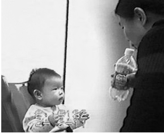
Fig. 5. Bottle condition with mother.

To our knowledge, this was the first study that compared infant responsiveness in the classic still-face with responses to modified still-face conditions where mothers maintained eye contact and affective stimulation either remained high (i.e., mask) or was completely absent (i.e., bottle). The similarity of infant responses in the mask and bottle conditions indicated that infants were not simply responding to variations in stimulation. In addition, the lack of negative responses indicated that emotional distress could not have interfered with infants' abilities to evaluate the reason why contact was broken, confirming the hypotheses put forth by Murray and Trevarthen (1985).