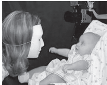
Fig. 3. (a) Natural, (b) still-face, and (c) masked-face conditions with mother.

with their infants (see Figure 3b), and (c) a condition during which mothers wore a mask to conceal their facial expressions, but were instructed to talk to their infants as usual (see Figure 3c). Thus, during the mask condition mothers were unable to communicate with their infants as they usually did, because something interfered with this activity, thereby providing infants with a cue or reason (mask) why there were changes in