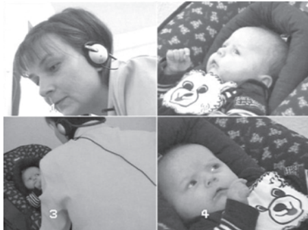
Fig. 1. (a) Natural, (b) imitative, and (c) yoked interactions with mother.