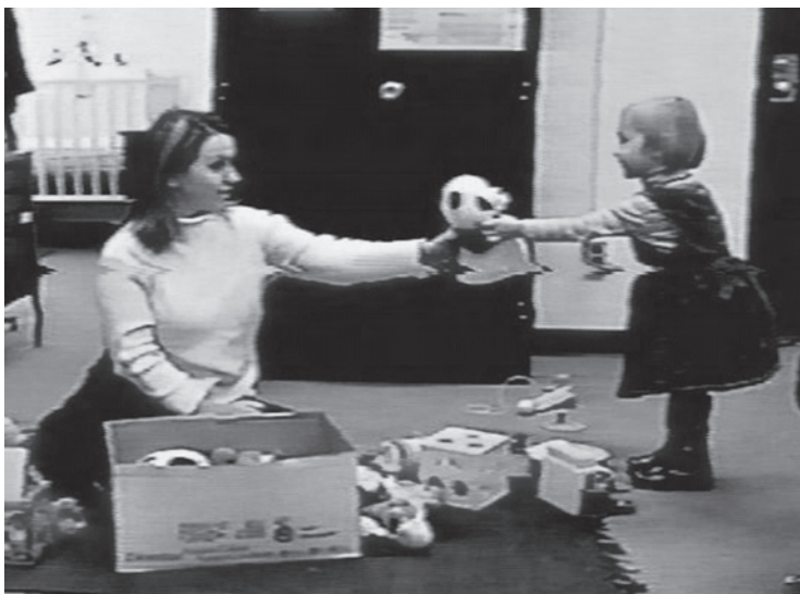
Fig. 8. (a) Mapping gestures (Point) with words: "You want that?" and (b) mapping gestures (Sharing) with words "I think that is a nice dolly".