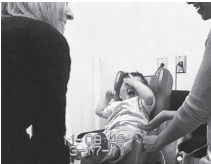
Fig. 6. (a) Baby puts foot in mouth in dialogue condition, and (b) Baby covers face in dialogue condition.