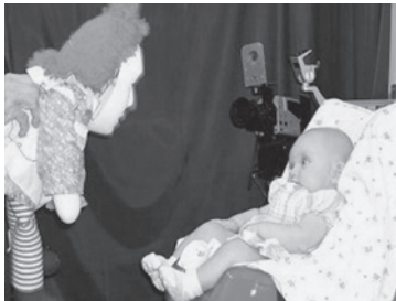
Fig. 4. (a) Natural, (b) still-face, and (c) masked-face conditions with doll.

not get upset. Overall, the results of the two studies revealed that across the ages tested infants responded consistently and appropriately to the various social and non-social conditions. They got upset when mothers refrained from communicating with them for no apparent reason (still-face), but not when mothers were unable to communicate (they wore a mask, or drank a refreshment). Thus in both studies infants discriminated between situations where mothers did not communicate with them because they had a reason from conditions where no reason was provided.