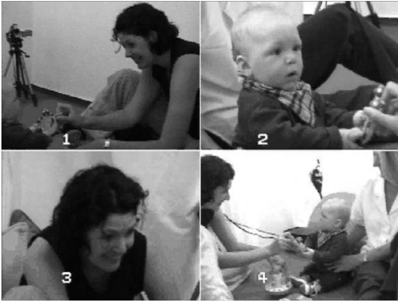
Fig. 7. Five-month-old infant coordinates attention between mother and toy.

the production of coordinated attention at 5, 7, and 10 months (Legerstee et al. , 2007). We expected that mothers who ranked high on maternal attunement would have infants who engaged in more mutual gazes at 3 months and that mutual gaze would predict higher levels of coordinated attention later on. At 3 months, the frequencies and durations of infant gaze monitoring of the adult's face was recorded each time the infant looked at the partner's face. At 5, 7, and 10 months, the frequencies and durations of infant coordinated attention were coded (Figure 7). Coordinated attention was defined as the infants' alternation of gazes between an object and a person's face and then back to the same object (see also Bakeman & Adamson, 1984; Carpenter et al. , 1998; Legerstee & Fisher, 2008; Legerstee, Van Beek, & Varghese, 2002; Legerstee & Weintraub, 1997).